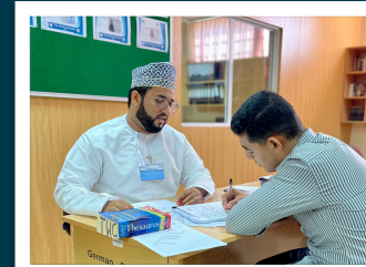
دروس عملية مصفرة

SSS peer tutors are accomplished graduate and undergraduate students from diverse disciplines who individually provide academic support to students. Tutorials are an excellent method for learners to seek advise, practice, and review course material with a peer mentor in preparation for an examination, test, or quiz.