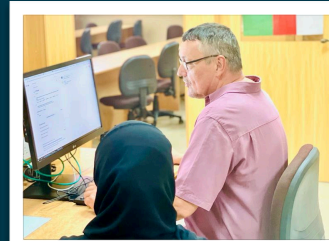
Academic Consultations - Graduation Projects